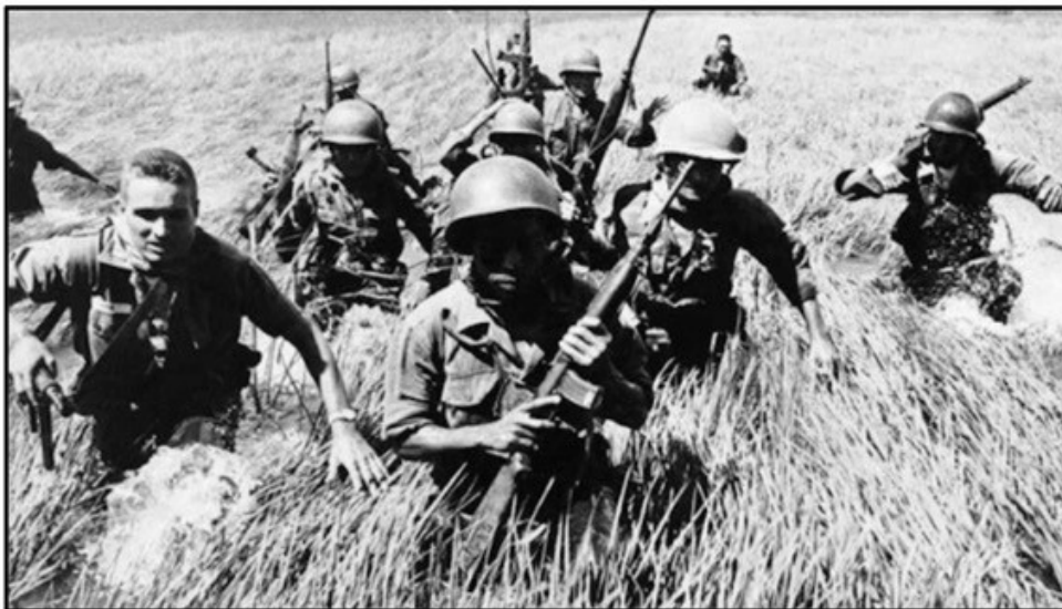
EXHIBIT ON DISPLAY NOW THROUGH JULY 4 TH

The stories of 30 local veterans who served during the Vietnam era. In commemoration of the 50 th anniversary of the War. We are open Thursdays 10-2 or by appointment, call 515-336-4491